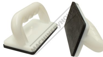
2 x Push Blocks