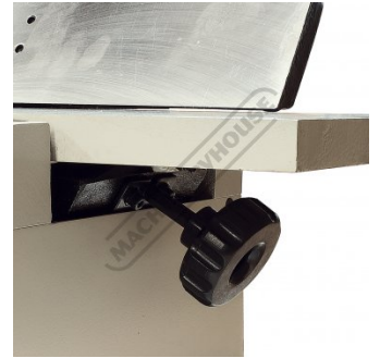
Table Height Adjustment Dial