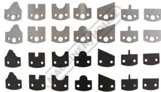
7 Profile Cutters