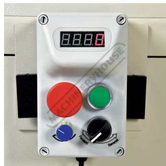
Variabe Spindle Speed Dial with Digital Readout Display