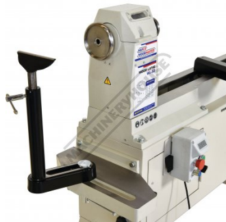
Bowl Turning Attachment