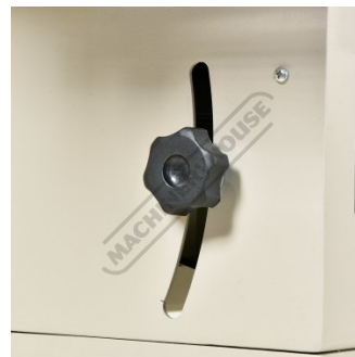
Motor Belt Tension Handle