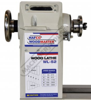
Visible Check Speed Selection