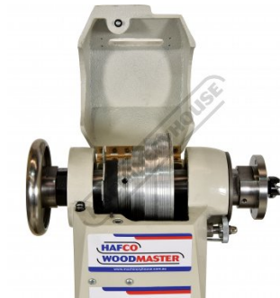
Flip Up Guard for Quick Belt Speed Change