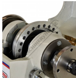
24 Position Indexing