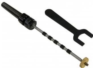
W306 Pen Mandrel Set - 2MT