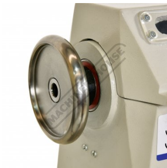
Spindle Hand Brake Wheel