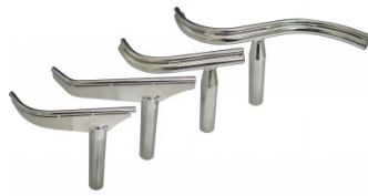
W295 Curved Tool Rest Set