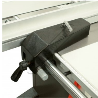
Heavy Duty Rip Fence Guide