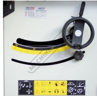
Tilt Gauge 45degrees And Blade Height Adjustment Hand Wheel