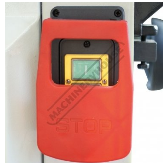
Safety Stop Switch