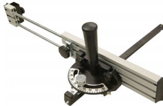
W308 Mitre Gauge & Fence