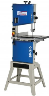
W952 Wood Band Saw