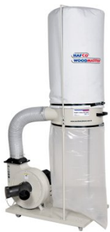
W394 Dust Collector