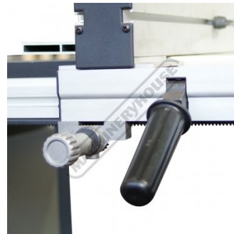
Micro Adjustment Rip Fence