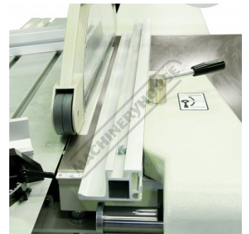
Heavy Duty Aluminium Extruded Fence with 2 Height Options