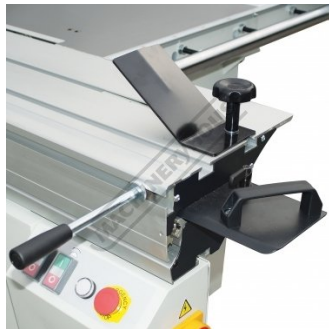
Table Handles and Table Lock