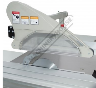
Blade Guard Raised Up