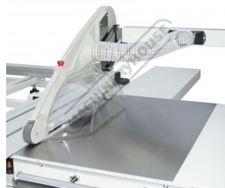
Tilting Blade Guard with Dust Extraction Hose