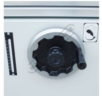
Blade Tilt Handle