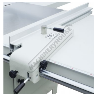
Heavy Duty Cast Fence Guide with Micro Adjustment