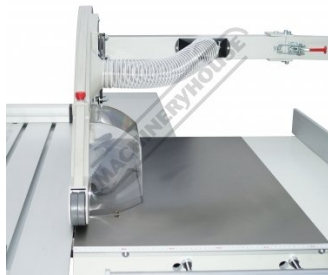
Tilting Blade Guard Front View