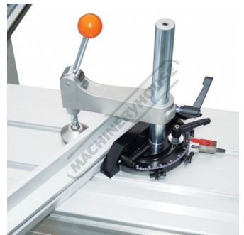
Angle Guide with Material Clamp