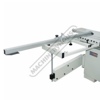
Solid Outrigger Table with Sliding Arm