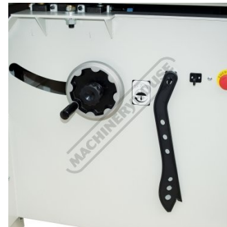
Blade Height Adjustment and Push Stick