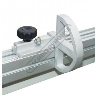
Flip Over Material Guide