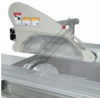
Tilting Blade Guard Raised