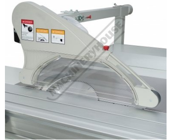
Tilting Blade Guard