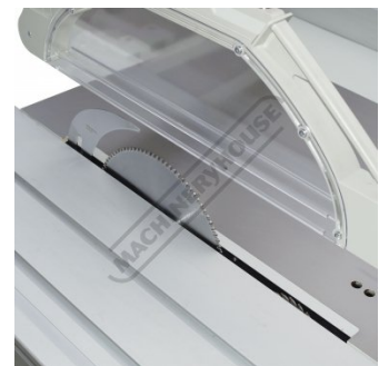
Main Blade with Scoring Blade