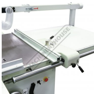
Fence Shown In Low Position For Thin Material