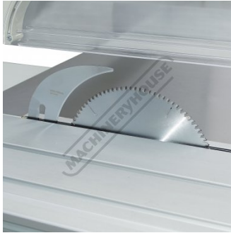
Main Blade Close Up