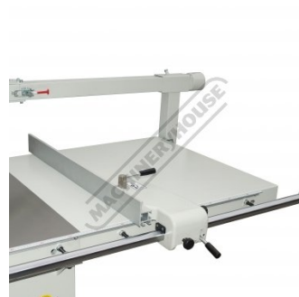
Fence Shown In High Position For Thicker Material