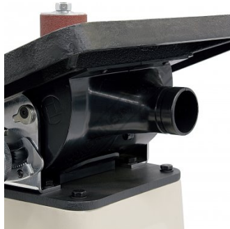
Ø50mm Rear Dust Chute Port