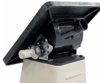
Table Tilted 45 Degrees - Rear View Close Up