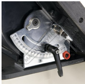
Table Tilt Lock Lever & Angle Degree Scale