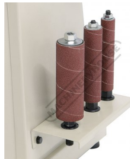
Storage Trays for Sanding Spindles