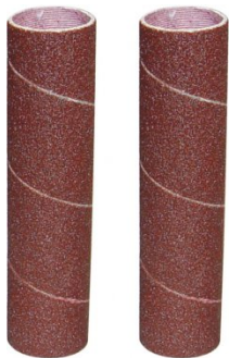
A8120 Bobbin Sanding Sleeves - Pack of 3