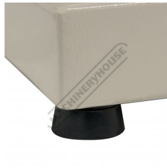
Anti Vibration Rubber Feet