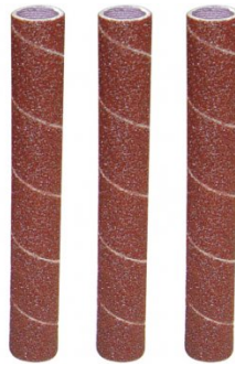
A8112 Bobbin Sanding Sleeves - Pack of 3