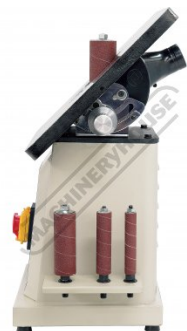
Table Tilted 45 Degrees - Right Side View