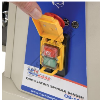
Safety Magnetic Start Stop Switch