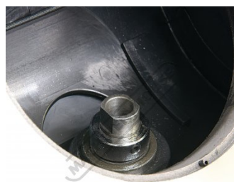
Sanding Spindle Drive Attachment