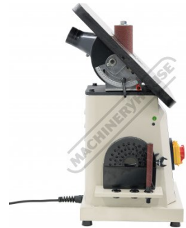
Table Tilted 45 Degrees - Side View