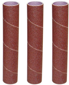
A8114 Bobbin Sanding Sleeves - Pack of 3