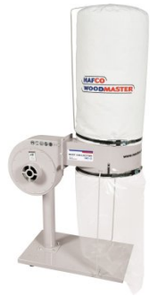
W332 Dust Collector