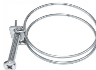
W3405 Dust Hose Clamp