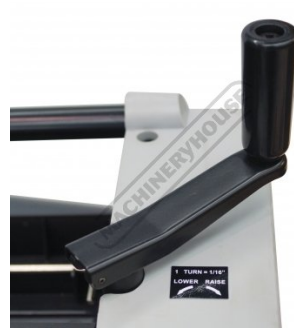
Height Adjustment Handle