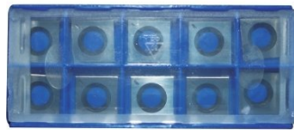
W817 Carbide Inserts for Spiral Cutter Heads on Thicknesser