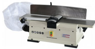
W618 Bench Planer Jointer