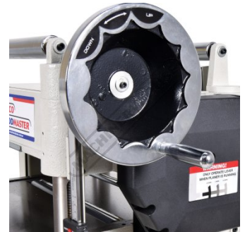
Height Adjustment Hand Wheel