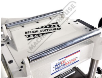
Top Rollers for Returning Material