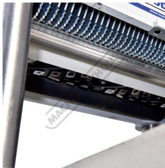
Five Helical Cutter Head With 80 Carbide Inserts