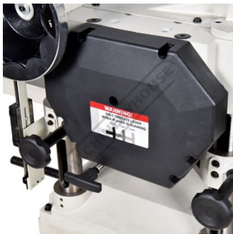
2 Speed Feed Gearbox