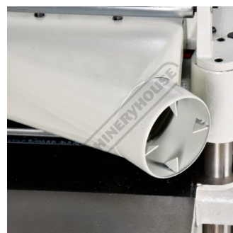
100mm Dust Outlet