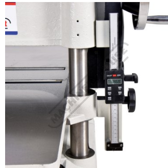
Digital Height Gauge