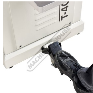
Moveable on Wheels