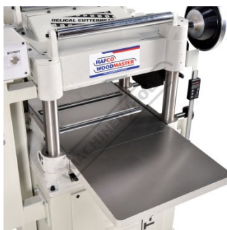
Cast Iron Infeed and Outfeed Tables