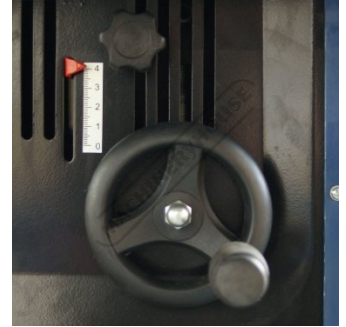
Spindle Height Adjustment