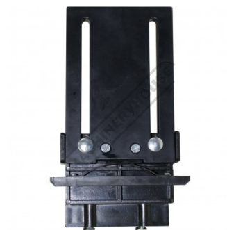
Top Clamp Rear View