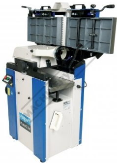
Set-Up For Thicknesser Right View