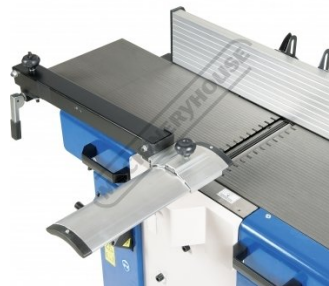
Adjustable Blade Guard Set