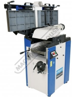
Set-Up For Thicknesser Left View