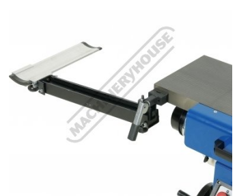
Flip Over Blade Guard