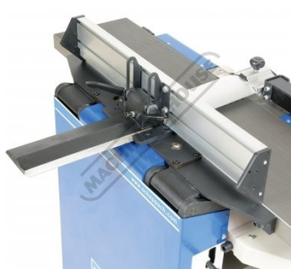
Fence Adjustment Locks