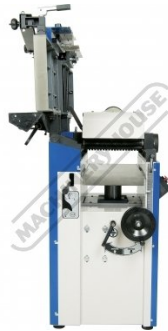
Set-Up For Thicknesser Side View