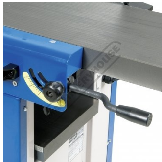
Table Height Adjustment Handle