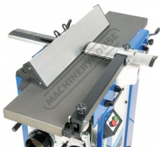
Fence Tilts to 45 Degrees