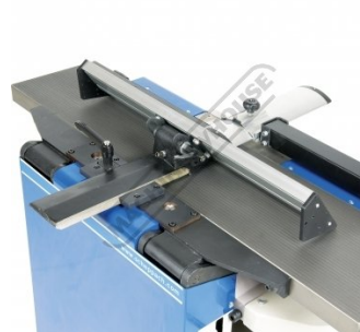
Fence Set-Up at 45 Degrees - Rear View