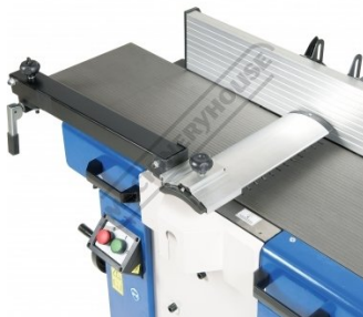
Adjustable Blade Guard