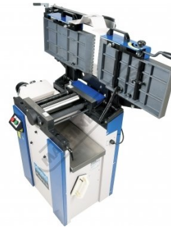
Quick and Easy Table Tilt System