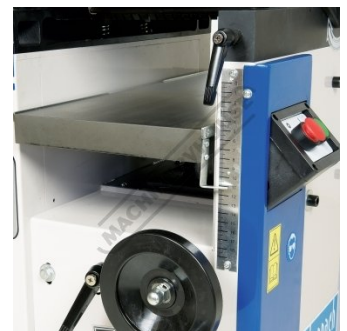
Thicknesser Table Height Adjustment Scale