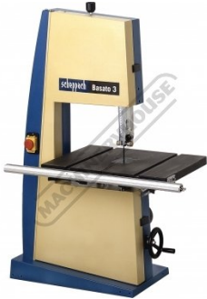
Basato 3 Tophalf