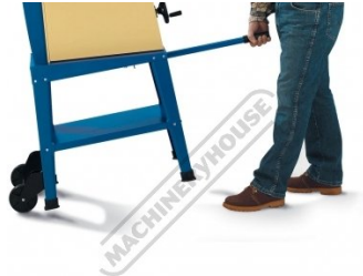
Basato 3 handle