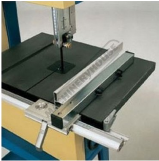
Precision rip fence with magnifier Conveniently inserted from above for right and left hand use