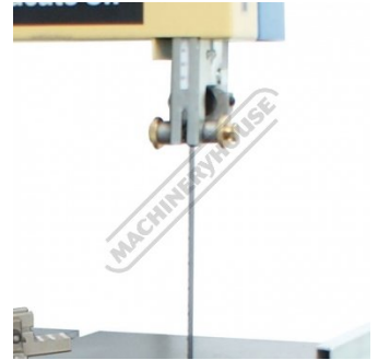
Twin 3 roller precision blade guides ensure precise cuts