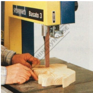
Unique variable speed drive system 370 750mm