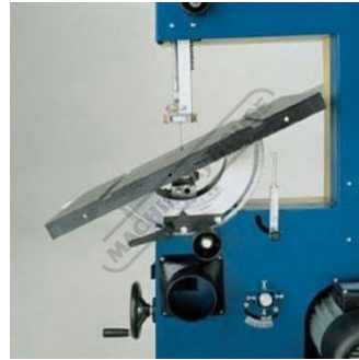
Large cast iron table with swivel capacity of -17deg to +45deg enhances versatility