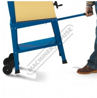
The new base unit with standard wheel base