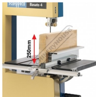
250mm Depth of Cut x 375mm Wide