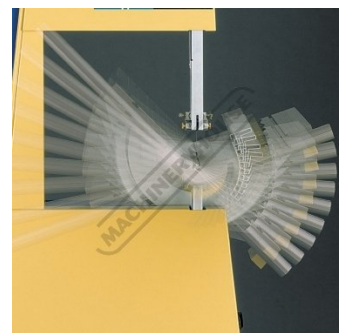
Table Tilt Range from 17° to +45°