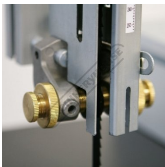
Industrial Triple Top Bearing Guides for Simple and Accurate Setting.