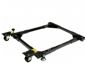
W931 Mobile Base - Heavy Duty