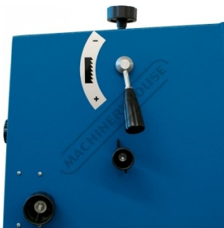
Quick Release System for Changing Band Saw Blade.