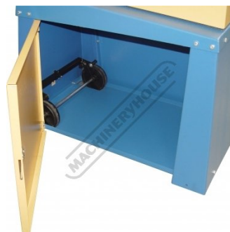
Cabinet Base with Internal Wheels with a External Quick Action Foot Lever