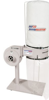
W332 Dust Collector