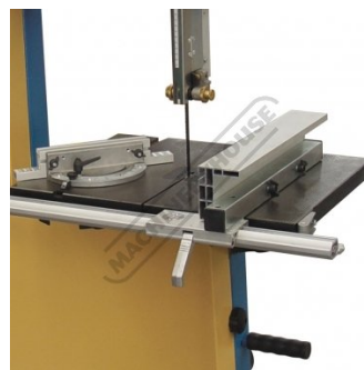
Large Cast Iron Table with Rigid Rip Fence Assembly