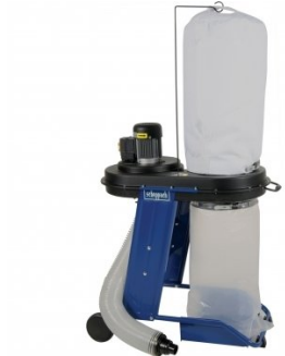
W886 Dust Collector