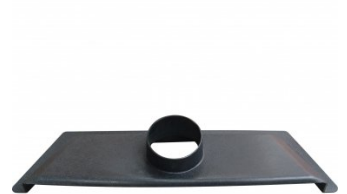
W339 Dust Hose Floor Sweeper Attachment