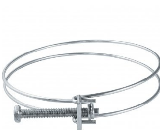
W340 Dust Hose Clamp