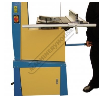
Easy Manoeuvrability with Simple Foot Lever and Lifting Handle