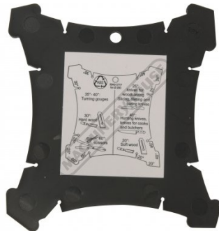
Angle Setting Jig