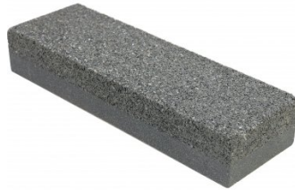
W8636 Stone Grader - Fine & Coarse