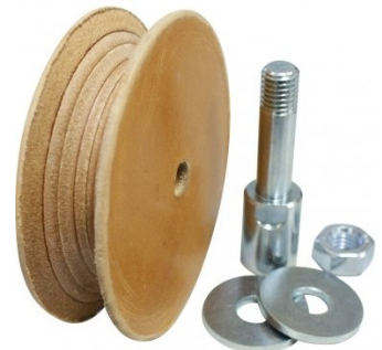
W8632 Leather Honing Disc