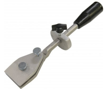
W8642 Jig 60 Knife & Blade Holder