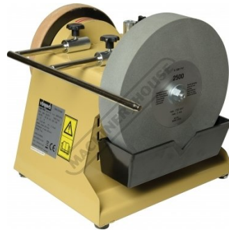
Rear Right View