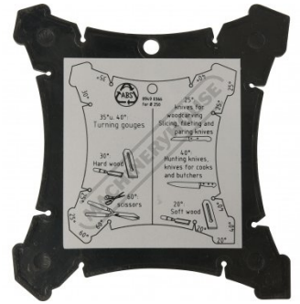
Angle Setting Jig