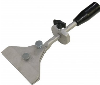
W8643 Jig 120 Knife & Blade Holder