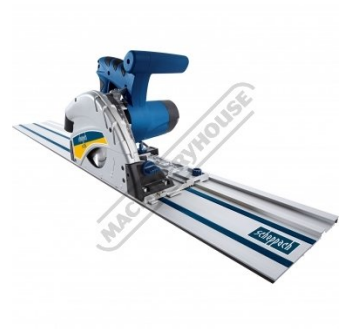
Saw in Up right Position - Shown with Optional Rail