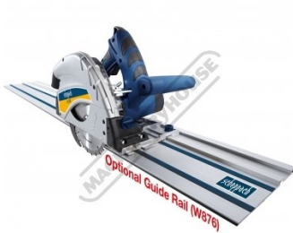
Shown with Optional Guide Rail