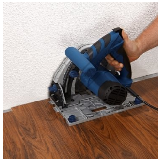
Ideal for edging up to 15.5mm from the wall