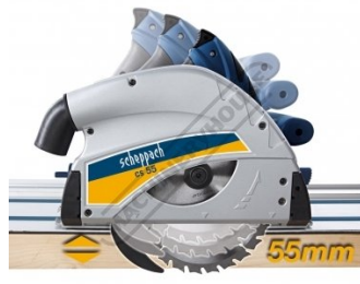
55mm maximum stepless cutting depth