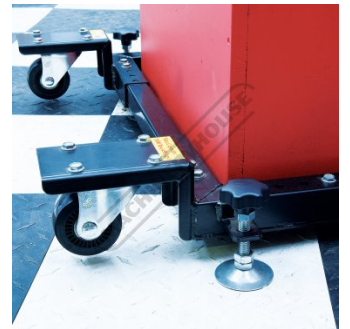
Hand Screw Positioning Lock