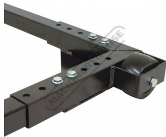
2 x Fixed Wheels