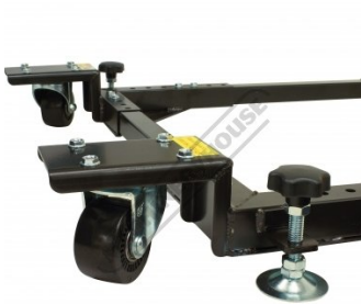
2 x Swivel Wheels with Adjustable Stops