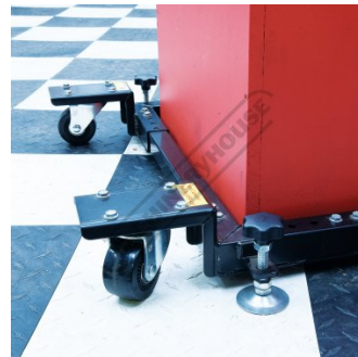
Swivel Castor 360 Degrees