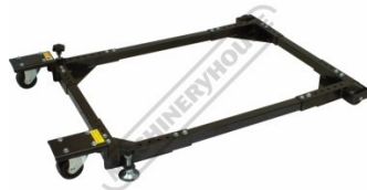
Rectangle 580 x 850mm Shown