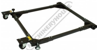
Square Maximum Size 750 x 750mm