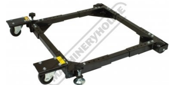
Square Minimum Size 580 x 580mm