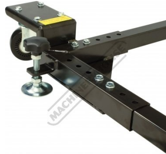
Adjustable Length Frame