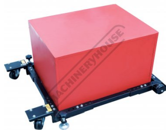
Shown with Box