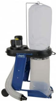
W886 Dust Collector