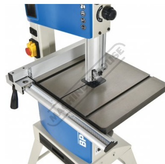
Cast Iron Table with T Slot