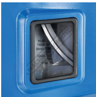
Blade Tension Scale