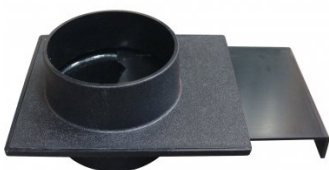
W335 Blast Gate