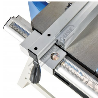
Sliding Rip Fence with High and Low Height Extrusion