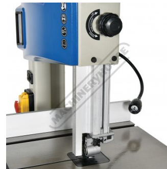
Blade Support Adjustment