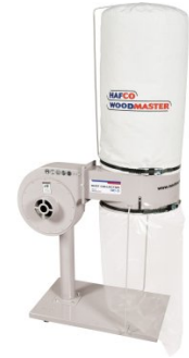
W332 Dust Collector