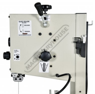
Blade Tension and Tracking Adjustments