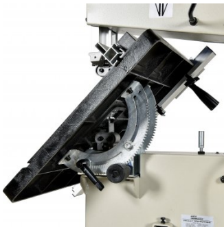
Tilt Table Adjustment