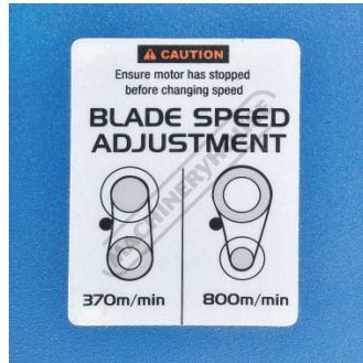
Blade Speed Adjustment