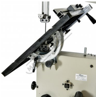
Tilt Table Adjustment