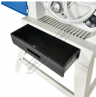
Dust collection Tray