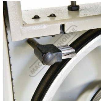
Wheel Cleaning Brush