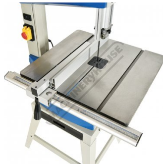
Sliding Rip Fence with High and Low Height Extrusion