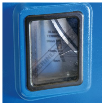
Blade Tension Scale