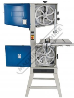
Easy Access for Blade Change