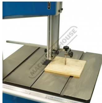
Shown with Optional Circle Cutting Attachment