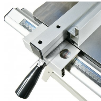
Fence with Quick Action Lock and Sight Glass