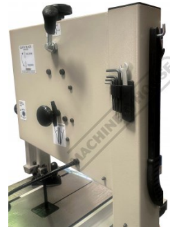
Push Stick and Tools