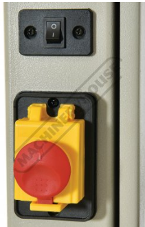
Safety Magnetic Switch and Light Switch