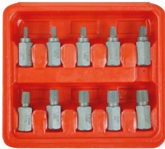
T870 Screw Extractor Set - 10 piece