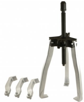
P005 Ratcheting Gear Puller Set