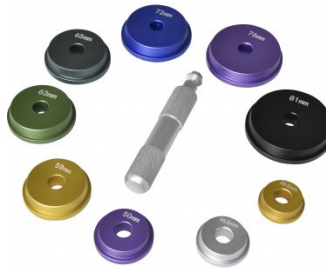
P031 Bearing Race & Seal Driver Set - 10 piece