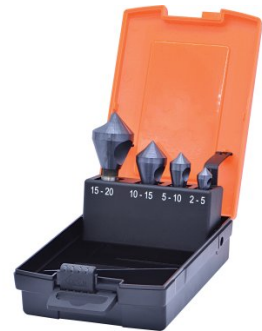
D1051 HSS Countersink Set (90° Cross Hole Type) - 4 Piece