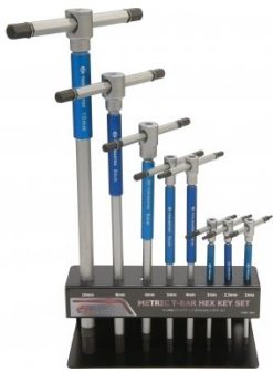
H820 Metric Hex Key Set with T-Bar Handle