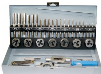
T013 Metric HSS Tap & Die Set - 32 Piece