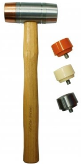
H875 Soft Face Hammer - 5 piece