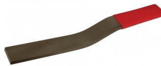
F160 Slapping File - Second Cut