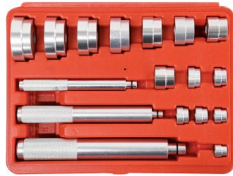
P030 Bush Driver Set - 17 piece