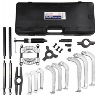
P011 Hydraulic Gear Puller Kit