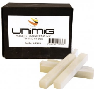
W103 Engineers Chalk Marker - 50 Splits