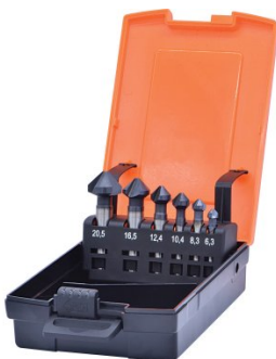
D1061 HSS Countersink Set (90° 3 Flute Type) - 6 Piece