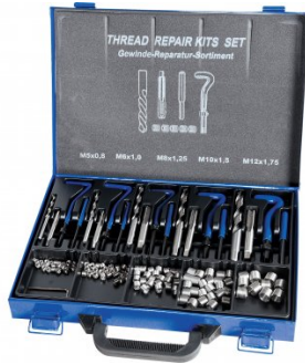
T100 Metric Thread Repair Kit - 130 Piece