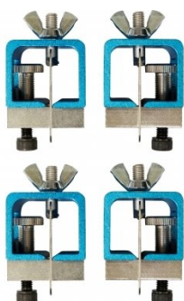
W113 Butt Welding Aluminium & Steel Clamp Set