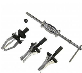
P013 Puller Set with Slide Hammer