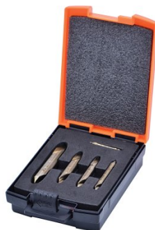
D508 HSS Industrial Centre Drill Set - 5Pcs